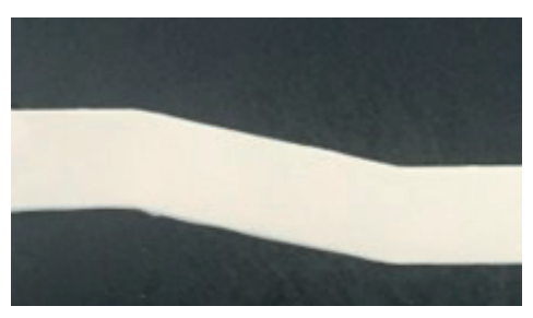
Angled section to increase the surface area coverage of the airway device